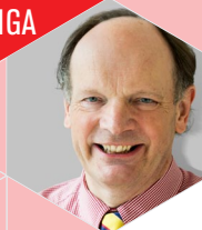
Prof Sir David Lane, A*STAR and NUS Chief Scientist, A*STAR. One of the scientists credited with the landmark discovery of tumour suppressor p53. World-renowned researcher with numerous accolades including the Buchanan Medal and the Paul Ehrlich Prize.

SOME OF THE WORLD'S LEADING SCIENTISTS WHO PARTICIPATE IN SINGA